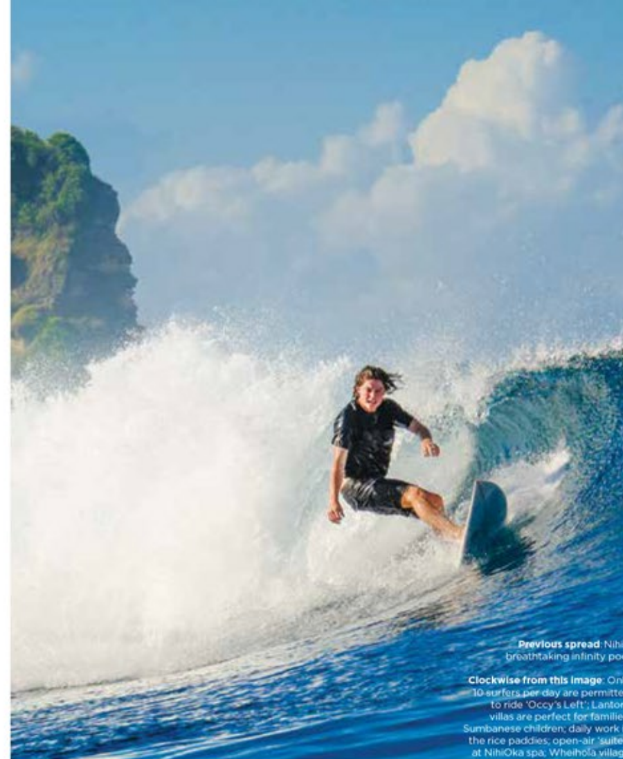
Previous spread: Nihi's breathtaking infinity pool

'Occy's Left' is a legendary left-hander break in front of the resort that beckons top-class surfers from all over the world, but beginners (under the guidance of a Tropicsurf teacher) can head to Coconut Cove's calmer waters not too far away.