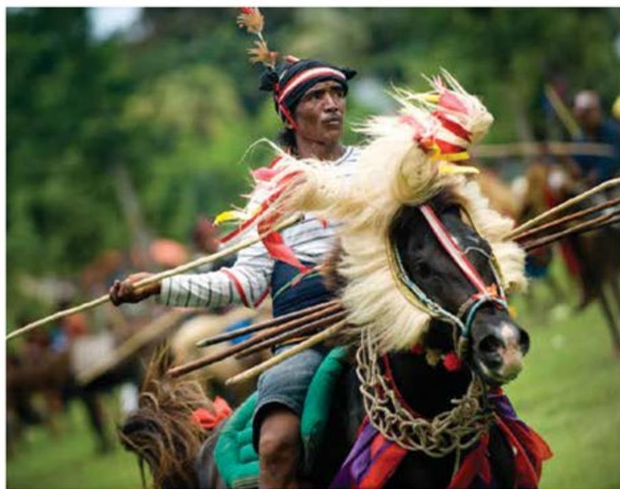
Clockwise from this image: Sunset rides along Nihi's wild beach; a Pasola horseman; paddleboarding down a river, is one of many excursions offered by the resort